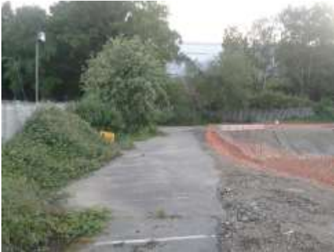
Cover to Moselle culvert from Pit 2