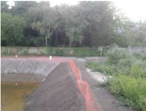
Cover to Moselle culvert from Pit 3