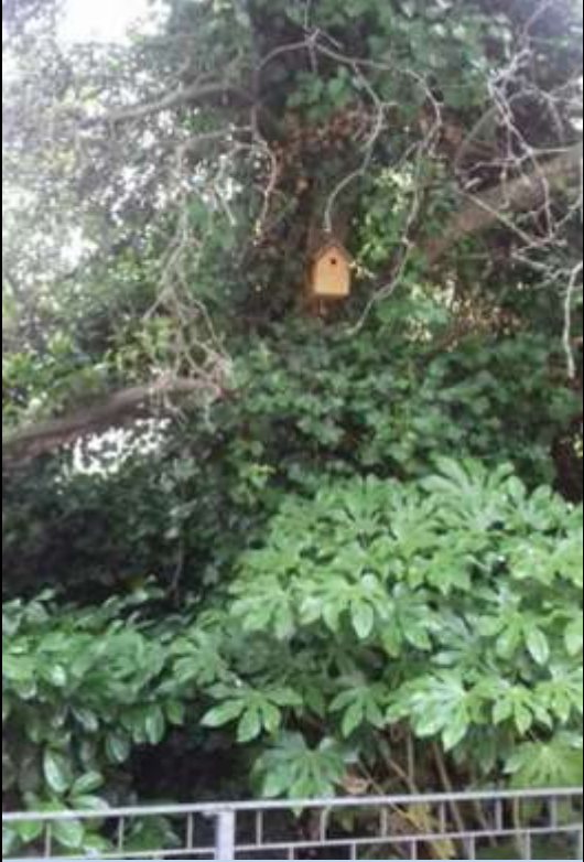
Lost garden and 70 year old surviving apple tree' and bird box (Spring 2020)