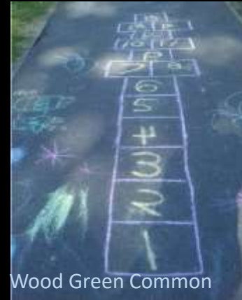
Wood Green Common