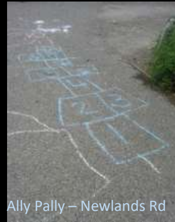
Ally Pally – Newlands Rd

Covid-19 2020 children's street games nearby