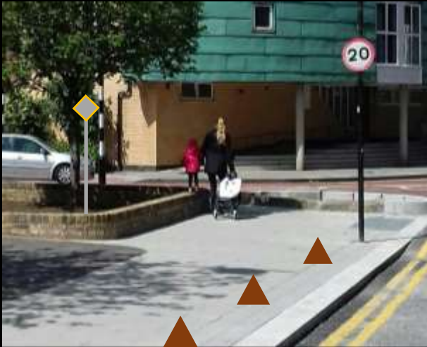
Approx. location of sundial and stone block protection to create a safe zone